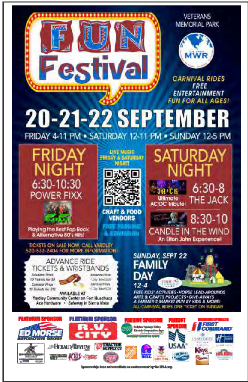
Sample Poster Tabloid Size - 11x17 inches