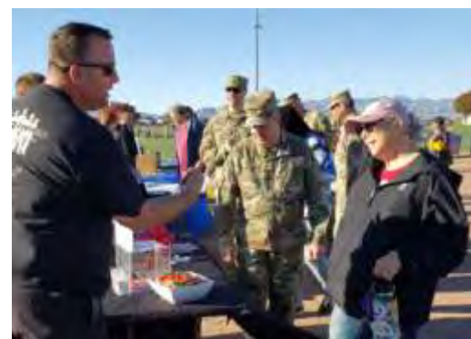
Right Arm Night (after Turkey Bowl)