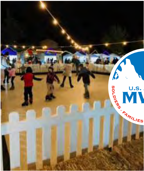
NOEL (Night of Extraordinary Lights) on Brown Parade Field