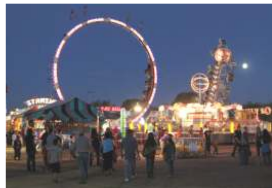
Festival of the Southwest

Bacon & Bourbon Fest Haunted Hay Ride *Thunder Mountain Challenge TM10 *Right Arm Night/Turkey Bowl Turkey Trot 5K Movie Night/Drive-in NOEL - Night of Extraordinary Lights New Year's Eve Party