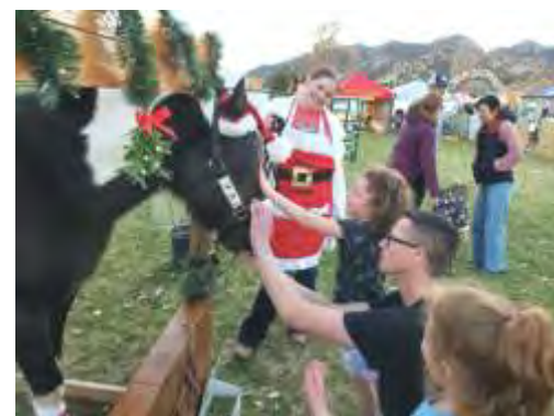
"Pony Kissing" booth at NOEL

The Better Opportunities for Single Service Members (BOSS) program represents the voice of the Single Service Member. The BOSS program is based on three program pillars: Quality of Life, Community Service and Recreation and Leisure. BOSS members have a voice in how they live, how they spend their leisure time and how they support the community around them. BOSS Members: Coordinate and participate in community service projects, organize recreation and leisure activities and actively support the quality of life needs of Single Service members. Sponsorship support for BOSS grants them the freedom to plan events and grow their program by providing necessary funding to put on quality events.