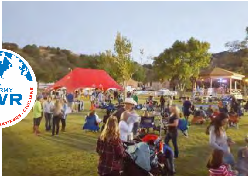
Jazz and Wine Fest on Brown Parade Field